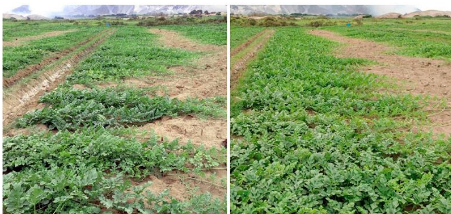
Figure 2: Left Untreated plants, Right Treated with Soil Activator™ Watermelon plants first month after transplanting